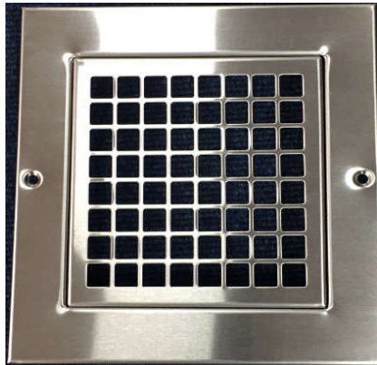
ECG-RC-SS Egg-Crate Style Grille (Removable Core)